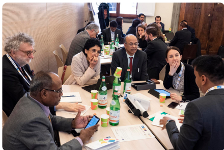
FSR Global Forum, 2019