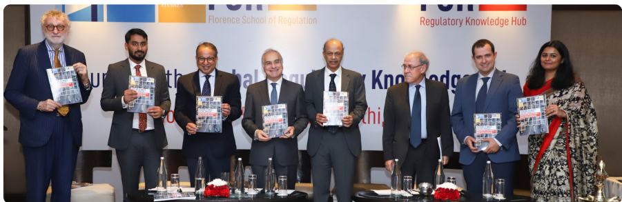
FSR Global Launch, 2019