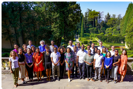
Open Africa Power, 2019