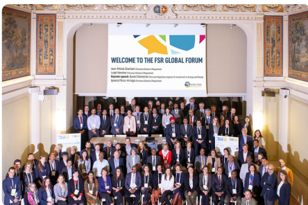
FSR Global Forum, 2019