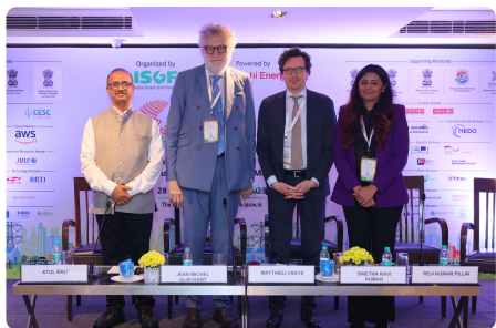
EU-India Regulatory Workshop, 2023