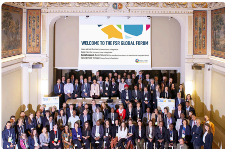
FSR Global Forum, 2019