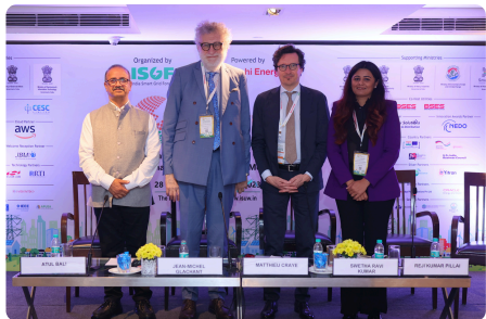
EU-India Regulatory Workshop, 2023