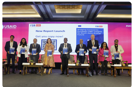
South Asia Clean Energy Forum, 2024