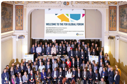
FSR Global Forum, 2019