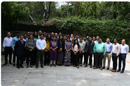
School on Energy Transition, 2023