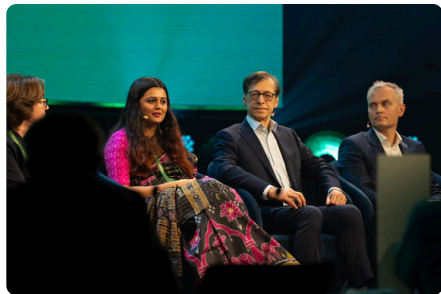
NTNU Energy Transition Conference, 2024